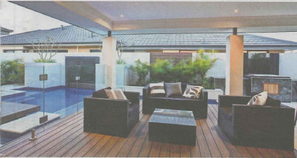
The Rockefeller's outdoor area features a plunge pool.