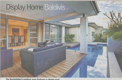
Display Home Baldviss

The West Australian NEW HOMES 4 February 2012