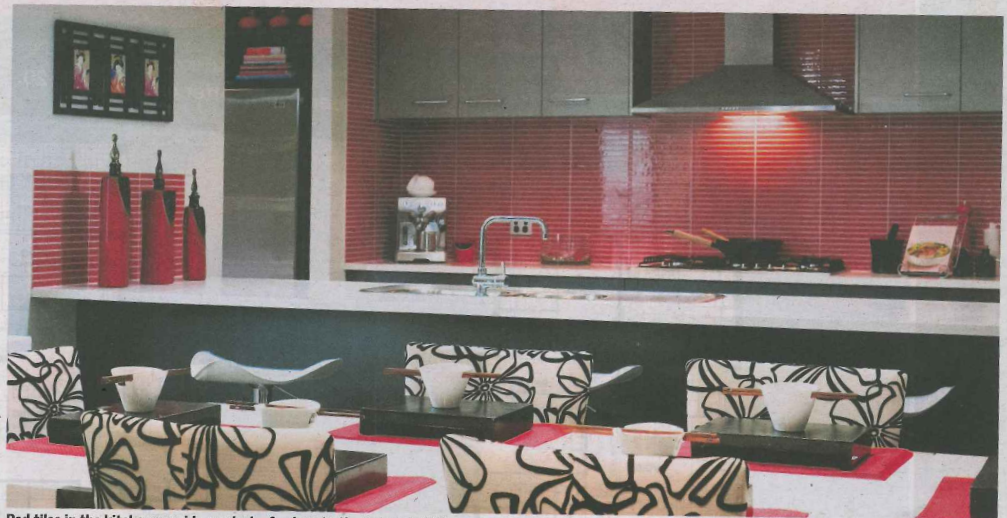
Red tiles in the kitchen provide a splash of colour to the Lotus at Millbridge.

The theatre room is on the opposite side of the house to avoid noise issues while the study further down the hall is of good size and handy to the living areas.